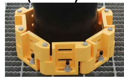
Once all the J-bolts are securely fastened, tighten each of the 3/8° x 3 1/2° bolts in the connecting holes.